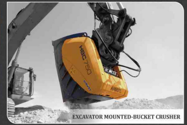
EXCAVATOR MOUNTED-BUCKET CRUSHER