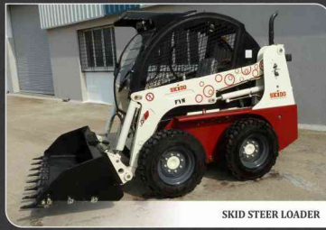
SKID STEER LOADER