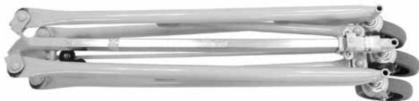
D. Complete tripod base assembly