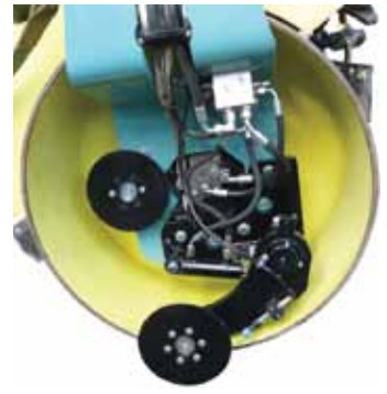
Lockable diesel-tank standard