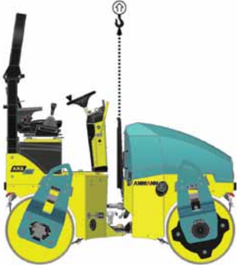
Central lifting point on ARX1(standard) ARX2(option)