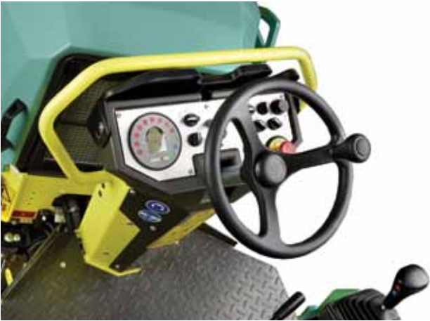
Clear dashboard layout