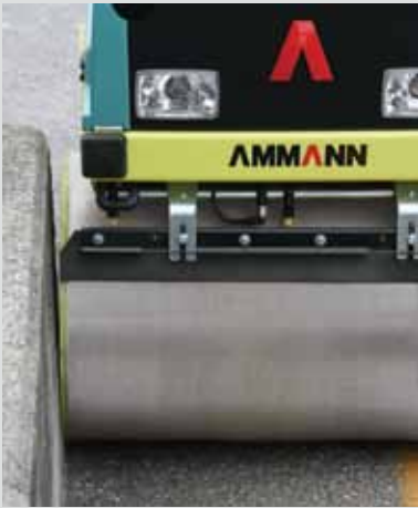
ARX1 - Complete side-free