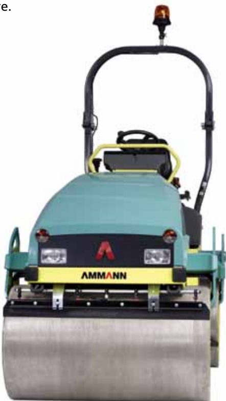
40 mm off-set of drums

The ARX12 - 20 tandem vibrating rollers are supplied as full flush models with double drive and double vibration as standard. This feature enables the drum to compact completely up against a wall. There is no more additional tuning work needed with additional compaction equipment.