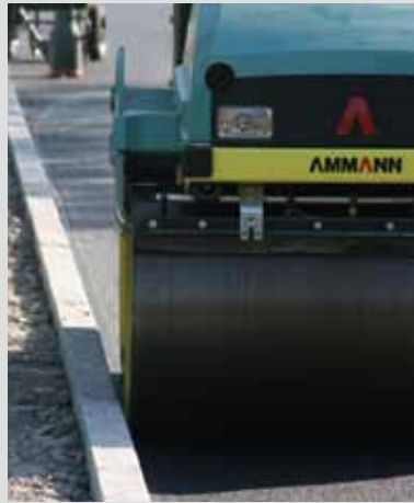
ARX2-4 - drum offset