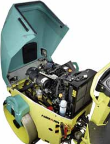
Best service access due to large engine hood