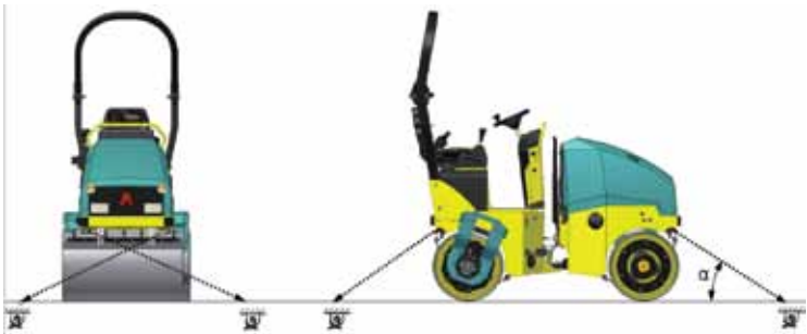
4 large tie down points for safe fixing onto trailer / truck