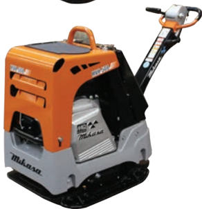
Plate size WxL in (mm) - 24x34 (600x860) Centrifugal Force lbs. (kN) - 10,116 (45) Exciter Speed VPM - 4,400 Operating Weight lbs. (kg) - 794 (360) Max travel Speed ft/min (m/min) - 79 (24) Cyclonic Pre-Cleaner - Single