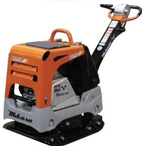
Plate size WxL in (mm) - 19.7x28.3 (500x720) Centrifugal Force lbs. (kN) - 8,318 (37) Exciter Speed VPM - 5,200 Operating Weight lbs. (kg) - 463 (210) Max travel Speed ft/min (m/min) - 85 (26) Cyclonic Pre-Cleaner - Single