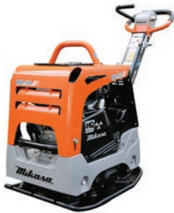
Plate size WxL in (mm) - 16.9x27.6 (430x700) Centrifugal Force lbs. (kN) - 6,070 (27) Exciter Speed VPM - 5,400 Operating Weight lbs. (kg) - 308 (140) Cyclonic Pre-Cleaner - Single Optional Wheel Kit - WHL158