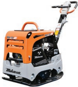
Plate size WxL in (mm) - 15.8x23 (400x580) Centrifugal Force lbs. (kN) - 5,058 (22.5) Exciter Speed VPM - 6,000 Operating Weight lbs. (kg) - 256 (116)