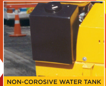
NON-CORROSIVE WATER TANK