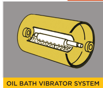
OIL BATH VIBRATOR SYSTEM