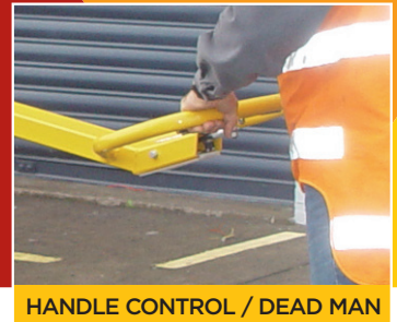
HANDLE CONTROL / DEAD MAN