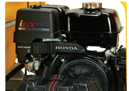
HONDA IGX ENGINE