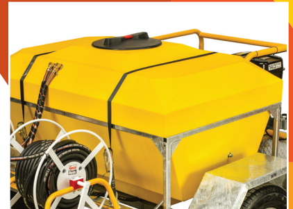
500L WATER TANK